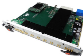
ATC136 – 2.6 GSPS A/D Converter