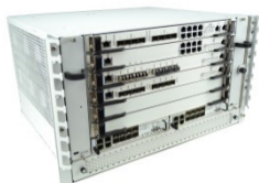
VT830 – 6U ATCA Shelf