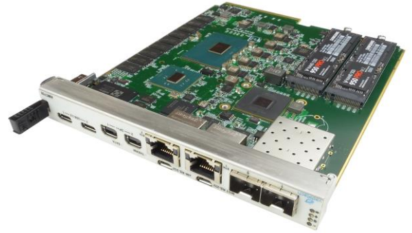
Figure 1: AMC758

The AMC758 provides up to 16 GB of DDR4 memory with ECC and 64 GB of Flash for the OS. The module has Serial over LAN (SoL). The BIOS allows booting from on-board Flash, off-board SATA, PXE boot and USB. There are dual USB 3.0 type C connectors for extended storage or peripherals. Linux OS is standard on the AMC758, consult VadaTech for other options.